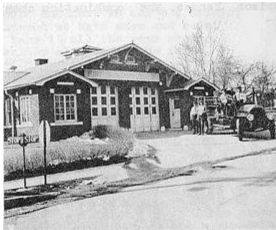
Kansas City, Kansas Fire Station No. 12

One of the provisions of Annexation was that a Fire Station would be built "on top of the hill."