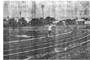
A night scene at Carnival Park (top) shows the tower that dominated the amusement park that was located on the grounds of the current Ward High School Athletic Field (bottom). The chute-the-chutes riding device (the chutes led from the tower) is one of the best remembered segments of the park.

Carnival Park was described as one of the city's greatest achievements.